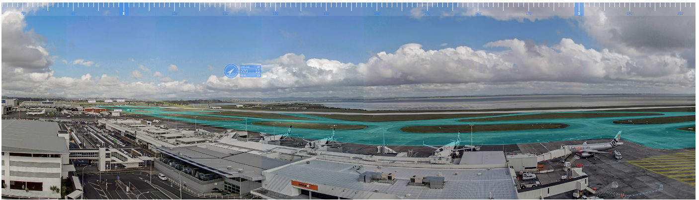
Figure 3: Digital panorama with information overlays at Auckland International Airport